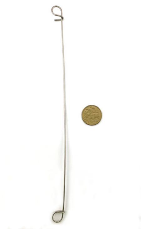
250mm stainless steel bag ties