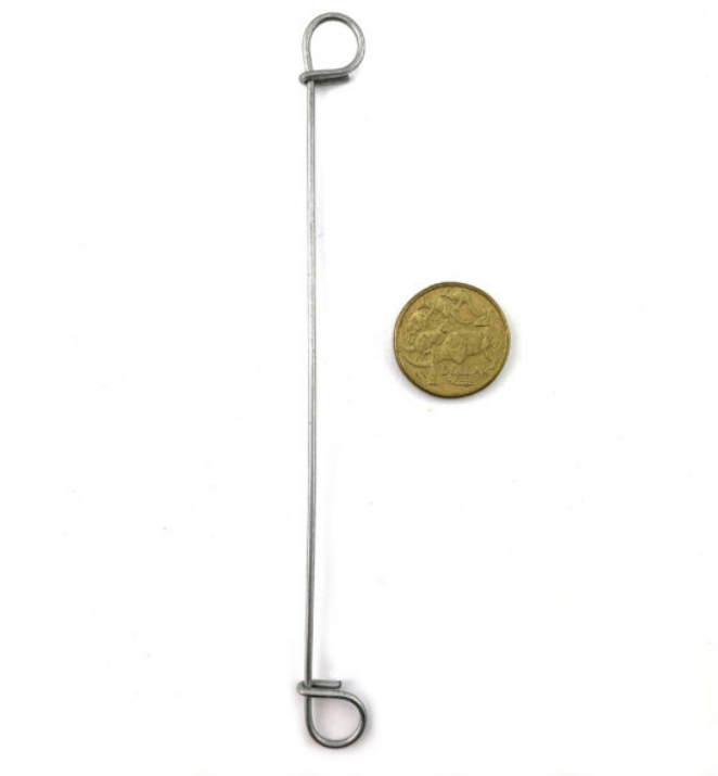
150mm galvanised steel bag ties