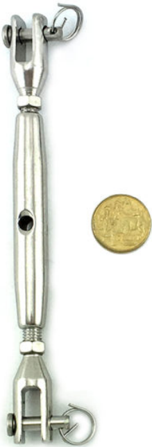
jaw to jaw closed body turnbuckle