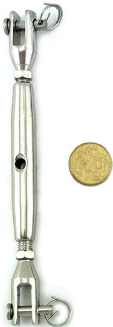
jaw to jaw closed body turnbuckle