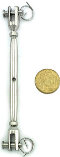
jaw to jaw closed body turnbuckle 5mm