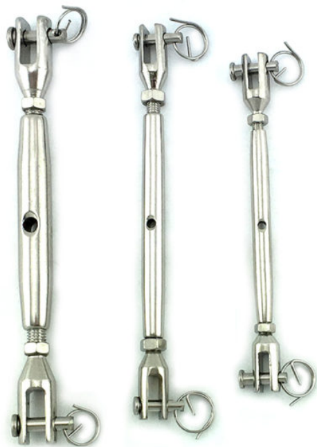
jaw to jaw closed body turnbuckle