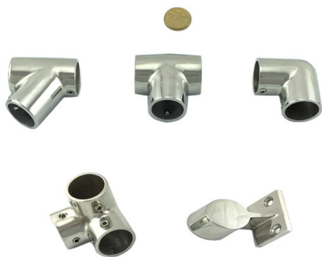
Rail Fitting Tube Fittings Stainless Steel range