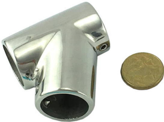
Rail Tee Branch 3 Way 45 degree x 25mm in Marine Grade Stainless Steel