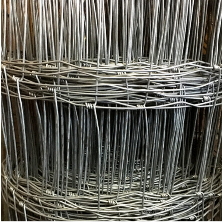
Hinge Joint Wire Mesh