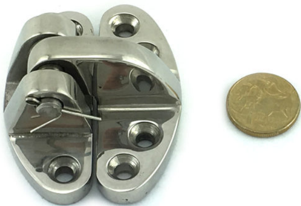
Hinge Deck Lid Stainless Steel