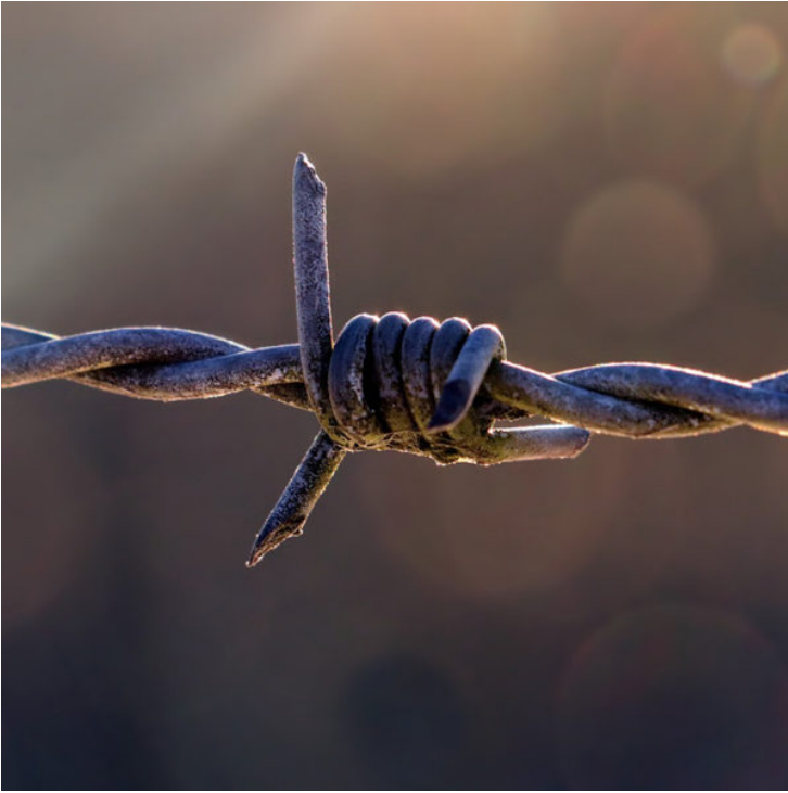
barb wire or barbed wire