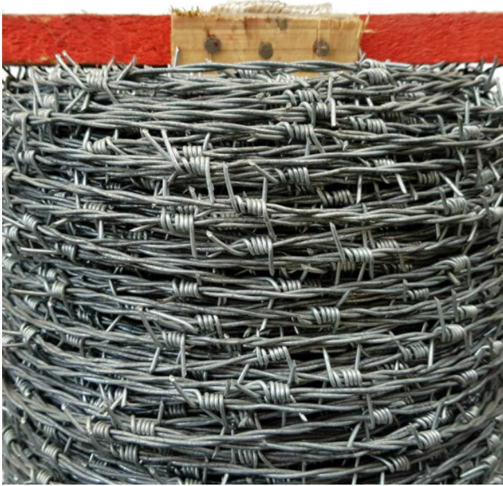
barb wire galvanised on reel